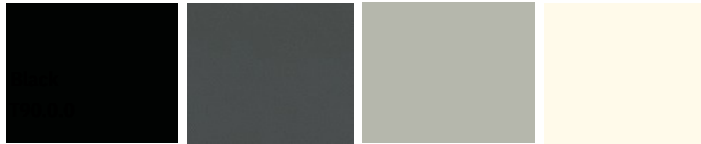
Slate Grey T70.0.0