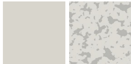
Pastel Grey Pastel Grey/Silver T30.0.1 D02.1.0